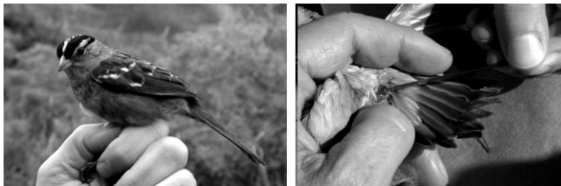
Capturing and bleeding Nuttall's white-crowned sparrows at Bodega Bay Marine Station, part of the University of California Reserve Systems.